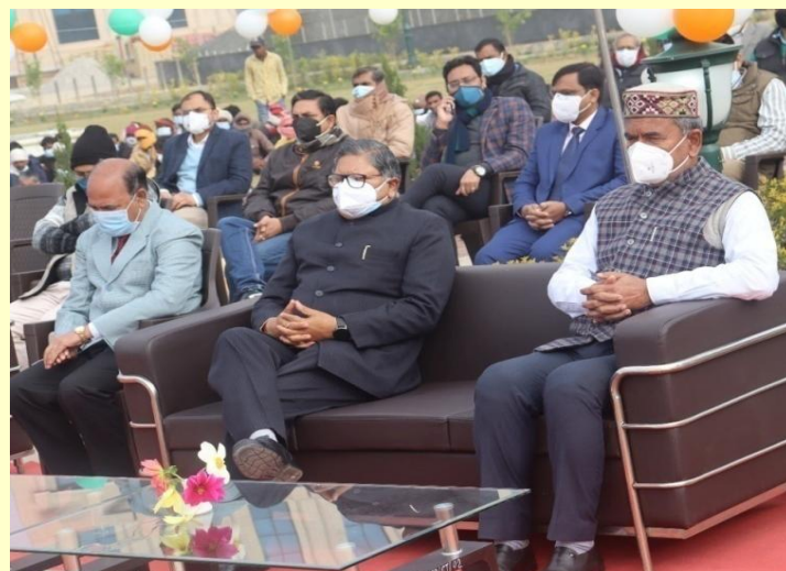
Fig. 10: Celebration of republic day