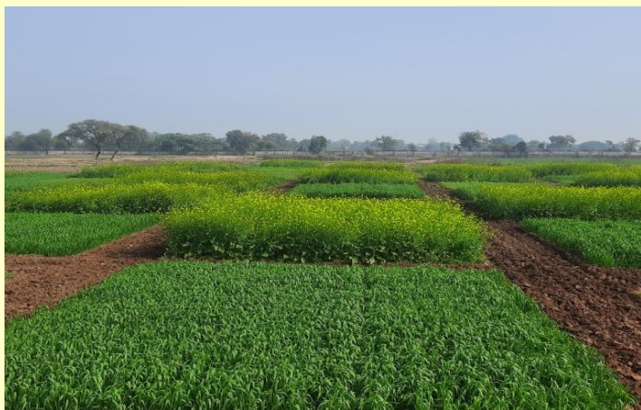
Fig. 1: In-situ rainwater management and crop diversification

An experiment entitled “In-situ rainwater management and crop diversification for climate-resilient agriculture” was initiated in 2020-21 at Rani Lakshmi Bai Central Agricultural University (RLBCAU), Jhansi (Fig. 1) to standardize the Agro-techniques for efficient use of irrigation and rainwater and crop diversification for climate-resilient agriculture in Bundelkhand. The experiment was conducted in a split-plot design with five In-situ rainwater harvesting methods: Control (Conventional Practice); Deep tillage; Horizontal mulching; Broad bed and furrow, and Ridge and furrow in the main plot, and three Cropping systems, namely: Groundnut-Wheat; Maize-Mustard and Sorghum-Chickpea in the sub-plot, replicated thrice. The mustard crop was sown in October month after the maize harvest, while Wheat and Chickpea crops were sown in November 2021 under zero tillage conditions with the help of seed-cum-ferti drill machine. Performances of zero-till crops are quite satisfactory, and very few weed problems were observed during the crop growth. (Yogeshwar Singh, Rajeev Nandan & S. Upadhyay).