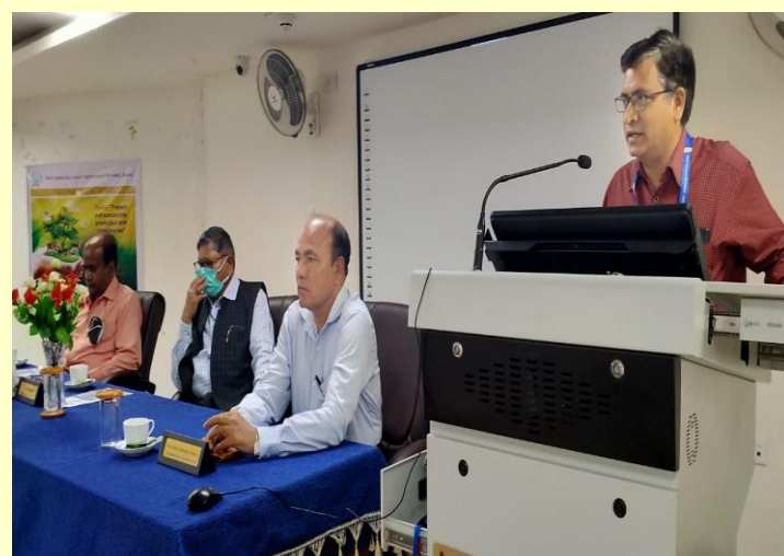
Fig. 17: World Forestry Day Celebration day