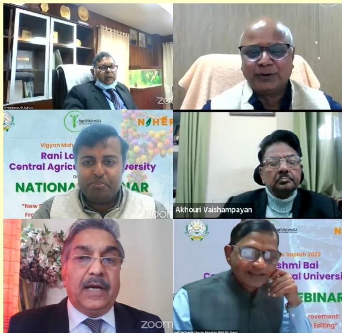
Fig. 11: Discussion during webinar

RLBCAU, Jhansi, an institution of national importance is organized a National Webinar on New Dimensions in Crop Improvement from Allele Mining to Genome Editing in virtual version on February 26 th , 2022 on the occasion of Vigyan Mahotsav 2022 (Fig. 11).