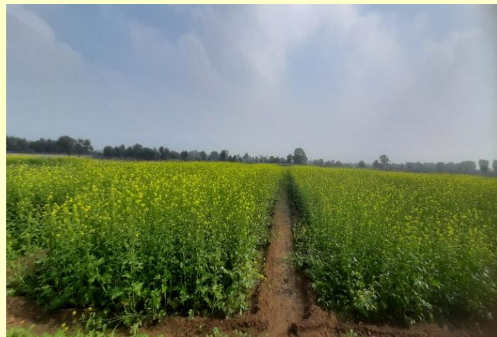
Fig. 2: Nutrient recommendations on STCR