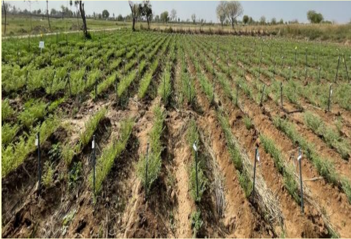
Fig. 4: 1000 accessions from NIPGR/ICRISAT

1000 accessions received from NIPGR/ICRISAT (Fig. 4) were sown on 19th January, 2022. In addition, 20 promising heat tolerant accessions selected during Rabi 2021 have also been sown. Heat tolerance varieties (J.G. 14 and IPC 2006-77) have been used as checks. These 1000 entries will be observed for pollen fertility, pollen germination and stigma receptivity. EC 542153 was found to be the most tolerant one in Rabi 2021. (S.K. Chaturvedi and Anshuman Singh).