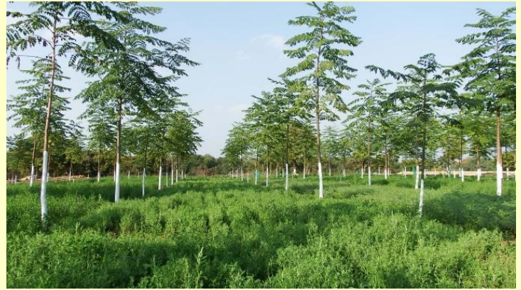
Fig. 5: Intercropping of legumes under industrial agroforestry

The experiment was conducted at H-12, and H-14 blocks of the Bhojla farm area of RLBCAU, Jhansi (Fig. 5). These tree species have been planted at 3 spacing (5m x 3m, 5m x 4m and 5 m x 3m) except Ailanthus excels , which was planted at 2 spacings (5m x 4m and 5 m x 3m) accommodating 144 plants of Melia in an area of 2500 m 2 , 168 plants of Gmelina and 148 plants of Kadamb in an area of 6000 m 2 and ardu 44 plants in 2000m 2 . The area between the rows was inter-cropped with lentil ( Lens culinaris ), grass pea ( Lathyrus sativus ) and chickpea ( Cicer arietenum ) in the Rabi season of 2020-21. Among growth attributes of Melia dubia , mean plant height and basal diameter were found maximum (199.44 cm, 4.18 cm) in 5 m x 3 m spacing compared to in 5m x 4m and 5m x 5m spacing. Mean plant height and Basal diameter were found to be a maximum of 157.36 and 3.43 ( Gmelina ), 149.78 and 4.74 ( Kadamb ) in both species under 5x5m spacing compared to in 5x4m and 5x5m spacing. Melia dubia , Neolamarckia cadamba , Gmelina arborea and Ailanthus excelsa are promising species of industrial agroforestry system and showed rapid growth during the investigation. (Prabhat Tiwari, R.P. Yadav, M J Dobriyal, Garima Gupta and A.K. Pandey).