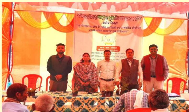
Fig. 16: Filed day of forestry, medicinal and aromatic plants