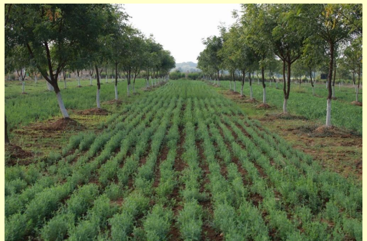
Fig. 6: Inter-cropping of Legumes under a neem-based agroforestry system

The neem tree was planted in 2019 at 6.0 m x 5.0 m spacing, with a density of 333 per hectare (Fig. 6). The region falls under a semi-arid ecosystem. The soil is very poor in fertility and is red, gravelly sand. The neem trees have been established with an almost 100% survival rate and have a very good growth rate. The area between the rows was inter-cropped with lentil ( Lens culinaris cv. IPL-316), grass pea ( Lathyrus sativus cv. Ratan), broad bean ( Vicia faba cv. Swarna Gaurav), chickpea ( Cicer arietinum cv. RBG 202), field pea ( Pisum sativus cv. IPFD 12-2 (W) & IPFD 10-2), fenugreek ( Trigonella foenum-graecum ) and jack bean ( Canavalia ensiformis ) in Rabi season of 2021-22. Among growth, attributes mean plant height and basal diameter were found maximum (199.44 cm, 4.18 cm). The neem tree is promising species of industrial agroforestry system and has shown rapid growth during the investigation. (R.P. Yadav, A. S. Kale, Prabhat Tiwari, Bijilakshmi Devi, M. J. Dobriyal, Garima Gupta, B. S. Pavithra and A.K. Pandey).