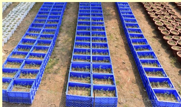
Fig. 3: Phenotyping of 85 germplasm lines of Chickpea

272 chickpea entries received from ICAR-IIPR, Kanpur are phenotyped each for Wilt and Collar rot disease of Chickpea under sick plot and pot conditions, respectively, in two replications (Fig. 3). Under wilt sick plot, around thirteen entries showed a resistant reaction. Similarly, six entries were found to be promising as tolerant/ resistant for collar rot disease of Chickpea. 500 chickpea entries received from ICRISAT and NBPGR under DBT funded Chickpea Project are phenotyped for Collar rot disease of Chickpea both under the sick plot condition and tray. Eight entries viz. ICC 585, ICC 2061, ICC 2484, ICC 2922, ICC 2994, ICC 3448, ICC 5585, and ICC 6821 were found to be tolerant/ resistant to collar rot disease both under field and pot conditions. (Meenakshi Arya).