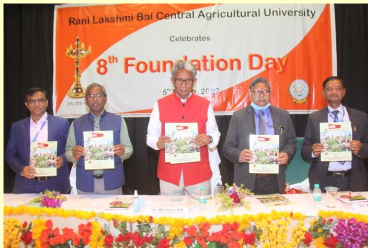
Fig. 12: 8 th Foundation day